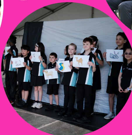
Accessible stage show featuring local and interstate Deaf performers