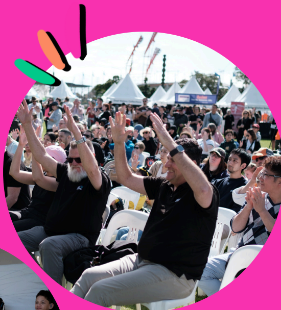
Almost 3,900 attendees from NSW and Interstate, and growing year on year