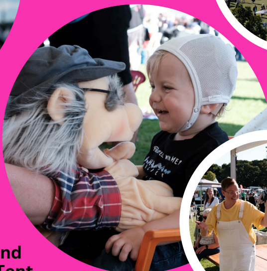
Kids Zone and Workshops Tent