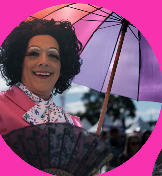
Diverse Communities and All Ages